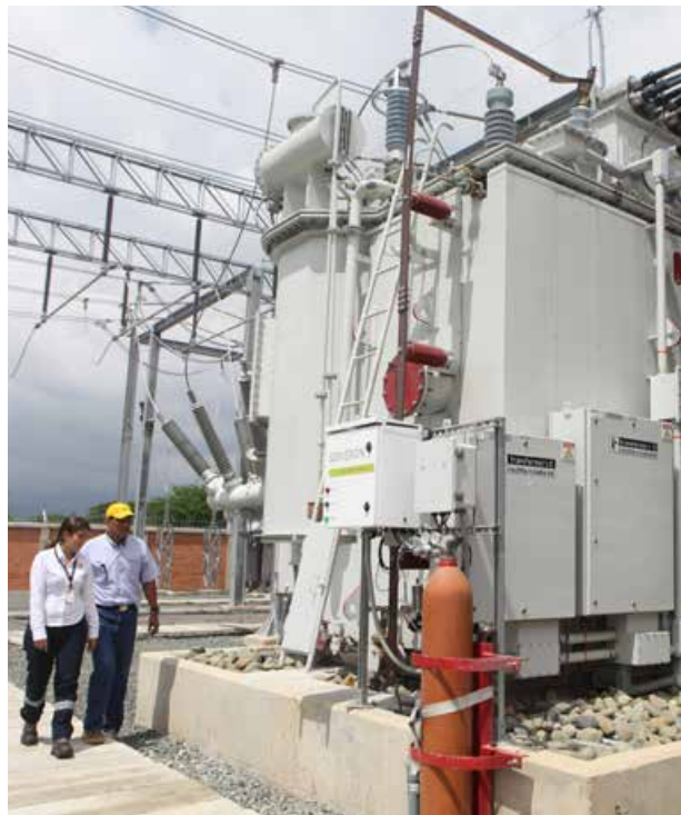
PCB PROJECT IMPLEMENTATION.