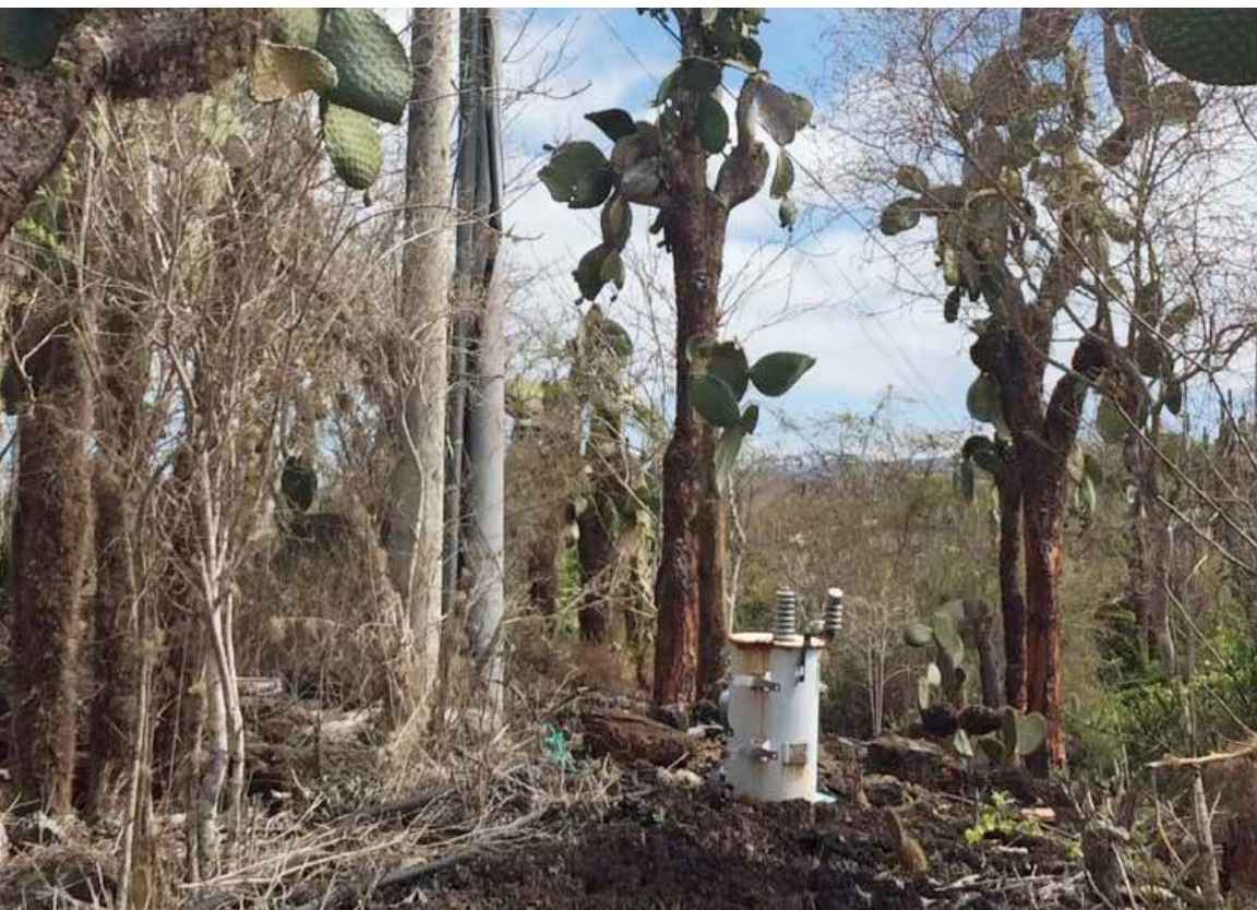
REPLACEMENT OF PCB CONTAMINATED TRANSFORMER (ISABELA, GALAPAGOS).