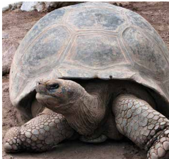
“CHELI” TORTUGA GALÁPAGO.