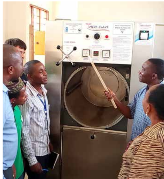
AUTOCLAVE OPERATION TRAINING.