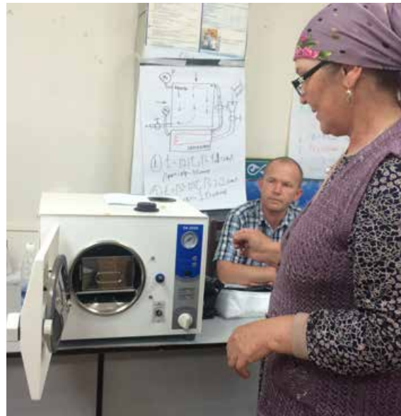
TRAINING ON USING THE PORTABLE TABLE AUTOCLAVE.