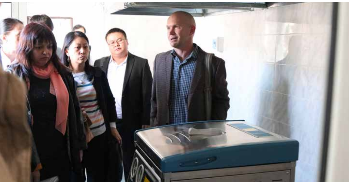
AUTOCLAVING ROOM AT A MATERNITY HOSPITAL IN BISHKEK.