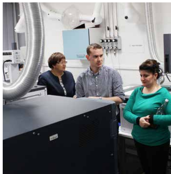
TRAINING ON POPs MONITORING. RECETOX CENTRE, MASARYK UNIVERSITY.