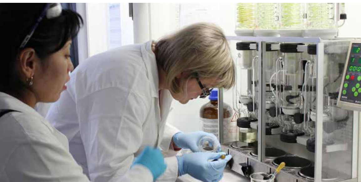
TRAINING ON IDENTIFICATION OF POPs.