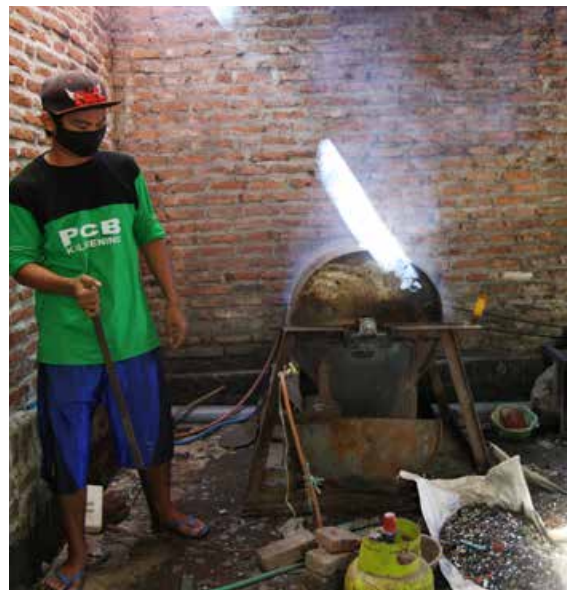
A MALE WORKER DISMANTLING E-WASTE IN MOJOKERTO AREA.