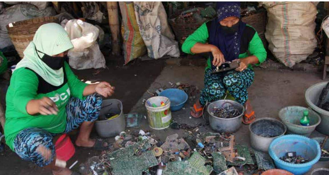
TWO FEMALE WORKERS IN MOJOKERTO AREA ARE DISMANTLING E-WASTE FOR FURTHER PROCESSING.

According to Pak Syafei, a Kejagan Village leader, at least 700 people work on recycling. The village in East Java has one of the largest non-organic waste management centres that processes waste from various regions in the country. According to Pak Ali Mustofa, 150 tonnes/day of plastics and waste are collected daily. It started very small in the 1970s with very few recyclers and collectors, since most villagers concentrated on farming.