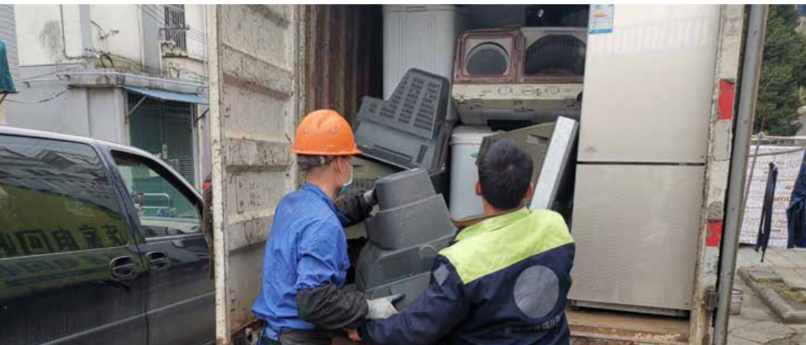
UNLOADING E-WASTE COLLECTED FROM NEARBY TOWNS.