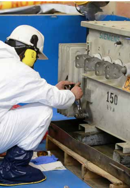
PCB PROJECT IMPLEMENTATION.